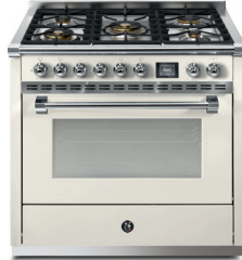
Nuvola + Chrome