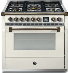
Nuvola + Bronze