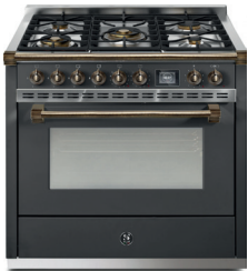
Anthracite + Bronze