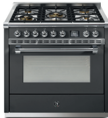
Anthracite + Chrome