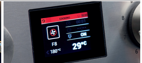
ADVANCED TFT DISPLAY

Our patented INNVENT system with double inverted rotation of the fans distributes heat evenly throughout the oven's cavity, not only vertically on different levels, but also horizontally on each level, allowing impeccable and homogeneous cooking. Your oven door can remain closed all the cooking time, because you won't have the need to rotate the tray halfway.