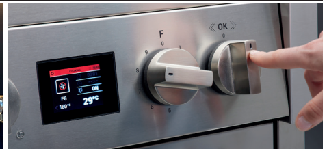
ADVANCED TFT DISPLAY

Our patented INNVENT system with double inverted rotation of the fans distributes heat evenly throughout the oven's cavity, not only vertically on different levels, but also horizontally on each level, allowing impeccable and homogeneous cooking. Your oven door can remain closed all the cooking time, because you won't have the need to rotate the tray halfway.