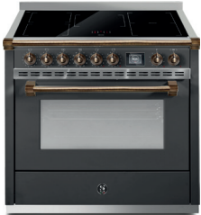
Anthracite + Bronze