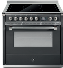
Anthracite + Chrome