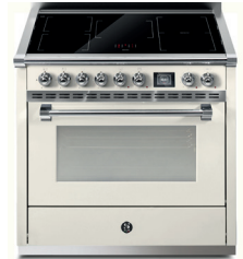
Nuvola + Chrome