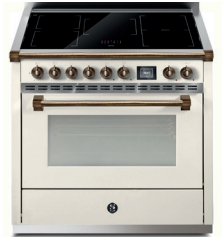
Nuvola + Bronze