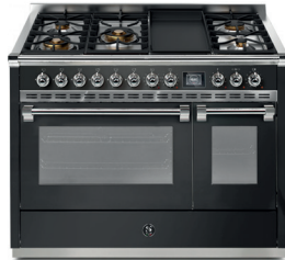
Anthracite + Chrome