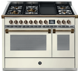
Nuvola + Bronze