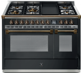
Anthracite + Bronze