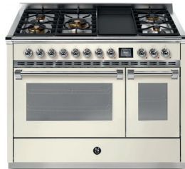
Nuvola + Chrome